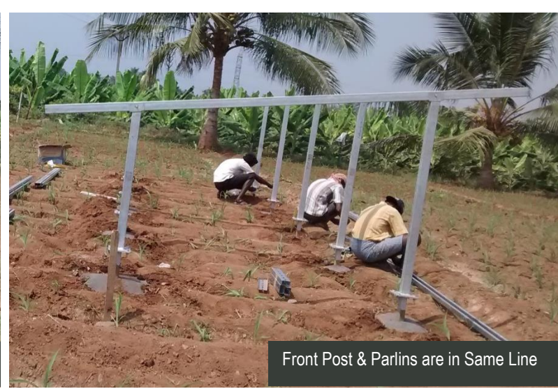
Front Post & Parlines are in Same Line