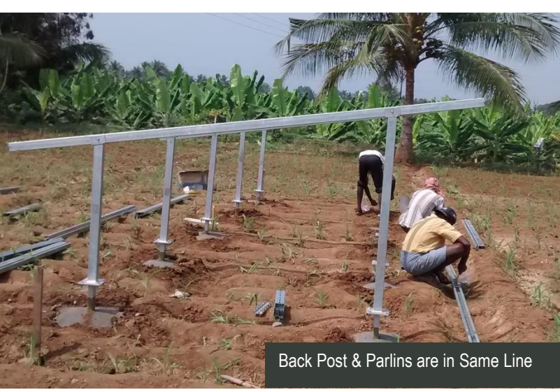
Back Post & Parlines are in Same Line