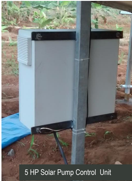
5 HP Solar Pump Control Unit