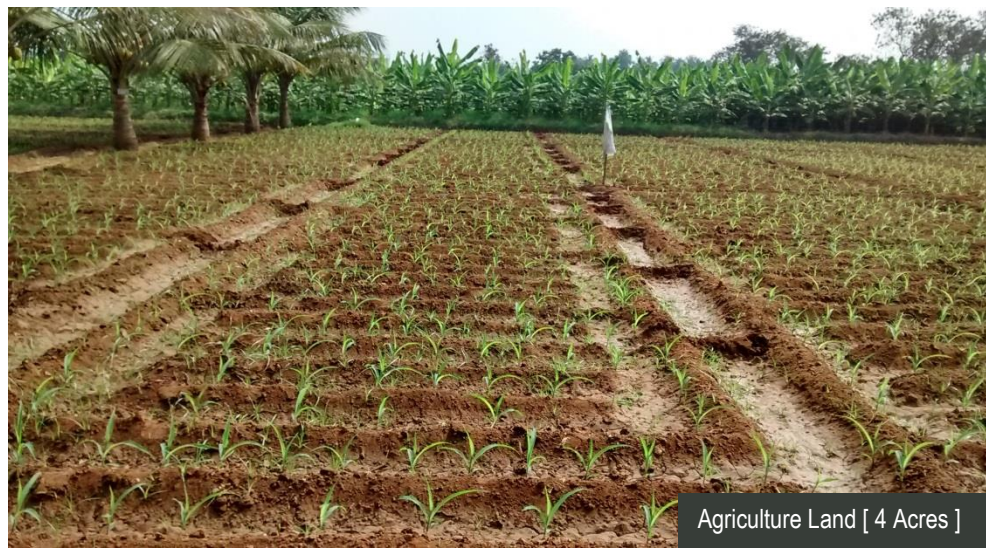
Agriculture Land [ 4 Acres ]